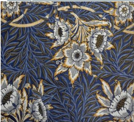
"Tulip and Willow" 1873

These are some of his famous designs that are still used today. You may have seen them used on notebooks, bags or even curtains and wallpaper.